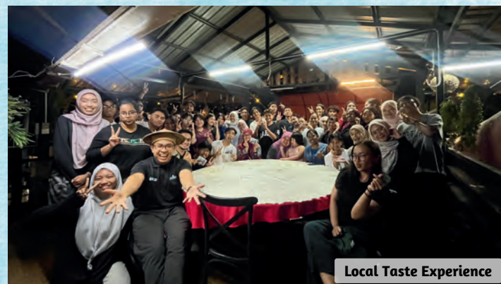
Local Taste Experience