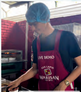
From Kitchen to Table: Discover Local Cuisine Secrets