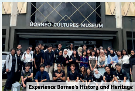
Experience Borneo's History and Heritage