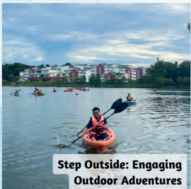
Step Outside: Engaging Outdoor Adventures