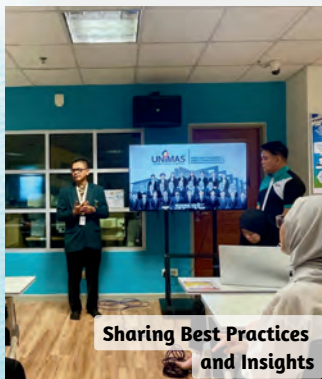
Sharing Best Practices and Insights