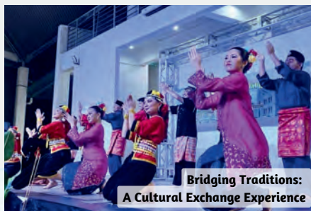
Bridging Traditions: A Cultural Exchange Experience